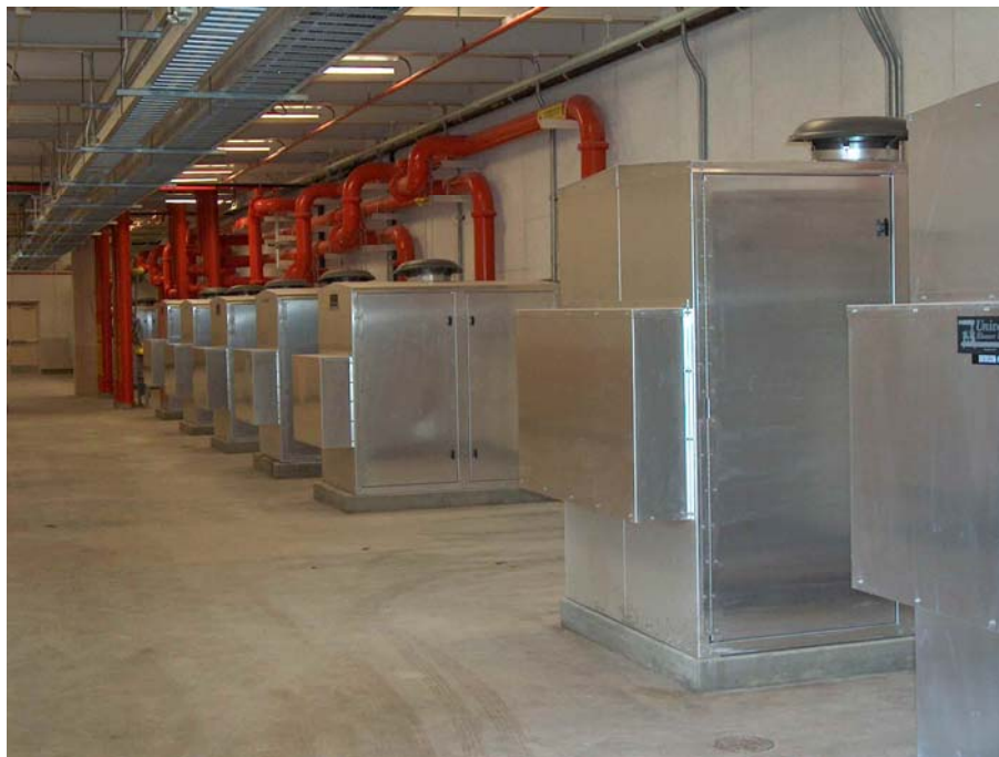
Fig 6: Attenu-Pacs in the Field

The Attenu-Pac enclosure provides the user with a very high amount of noise attenuation for the system. As you can see from figure 5, the package is still configured with large multi-chamber/absorptive inlet and discharge silencers. These combine chambers, which are specifically configured to provide destructive interference of low frequency noise, and absorptive material to attenuate high frequency noise. This results in much lower noise levels than smaller combination inlet/filter silencers. The Attenu-Pac acoustical enclosure is constructed of galvanized steel, powder coated steel, or aluminum and is backed with high density acoustical foam. It is suitable for outdoor operation. Please see additional enclosures in figure 6.