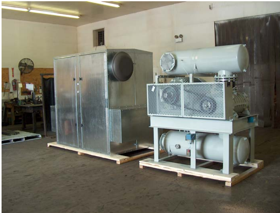
Fig 5: Attenu-Pac Full Enclosure