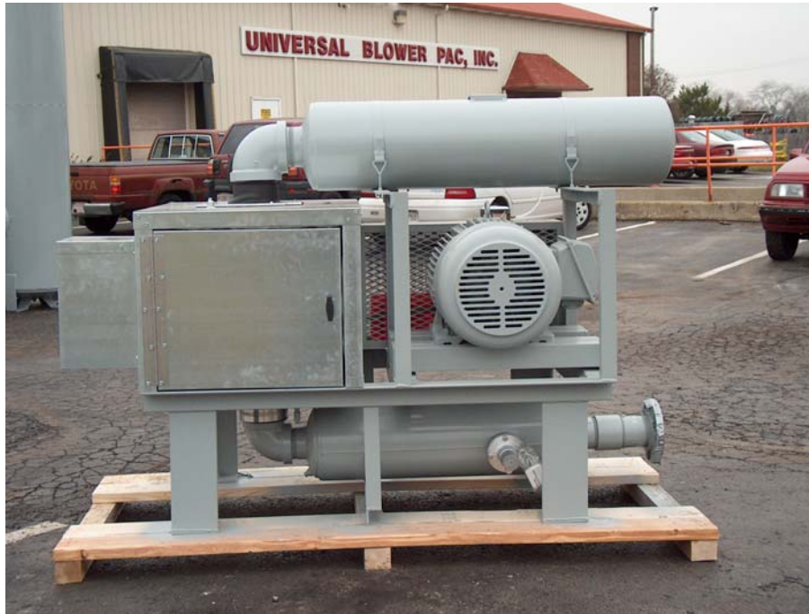
Fig 3: Acousti-Pac Partial Enclosure

The enclosure is constructed of galvanized steel, powder coated steel, or aluminum and high density acoustical foam backing. It is cooled by one or two small electric fans, depending on the size of the application. The enclosure is suitable for outdoor operation. It allows for greater maintenance accessibility to the unit and ancillary equipment. Additionally, this enclosure allows for lower blower operating temperatures because the discharge piping is entirely external to the unit. In some applications where the units are very large it is also beneficial to enclose the motor and drive assembly along with the blower. Please see an internal view of the enclosure in the following figure.